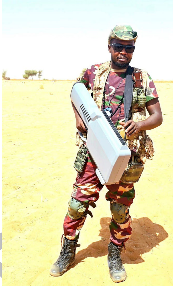
A SAF soldier equipped with a Skyfend Hunter drone jammer. 142

China acceded to the ATT in July 2023. Since then, like Serbia, China has legal obligations under Article 6 of the treaty not to authorize any transfer of conventional arms if they have knowledge at the time of authorization that the arms or items would be used in the commission of genocide, crimes against humanity or war crimes. 143 China is also legally obliged under the ATT's Article 7 to conduct an objective and non-discriminatory assessment of all exports of conventional arms and deny export authorization if there is a substantial risk that the arms could be used to commit or facilitate a serious violation of international human rights or humanitarian law. 144 Furthermore, under Article 11, China must also take measures to prevent the diversion of conventional arms covered by the Treaty. 145