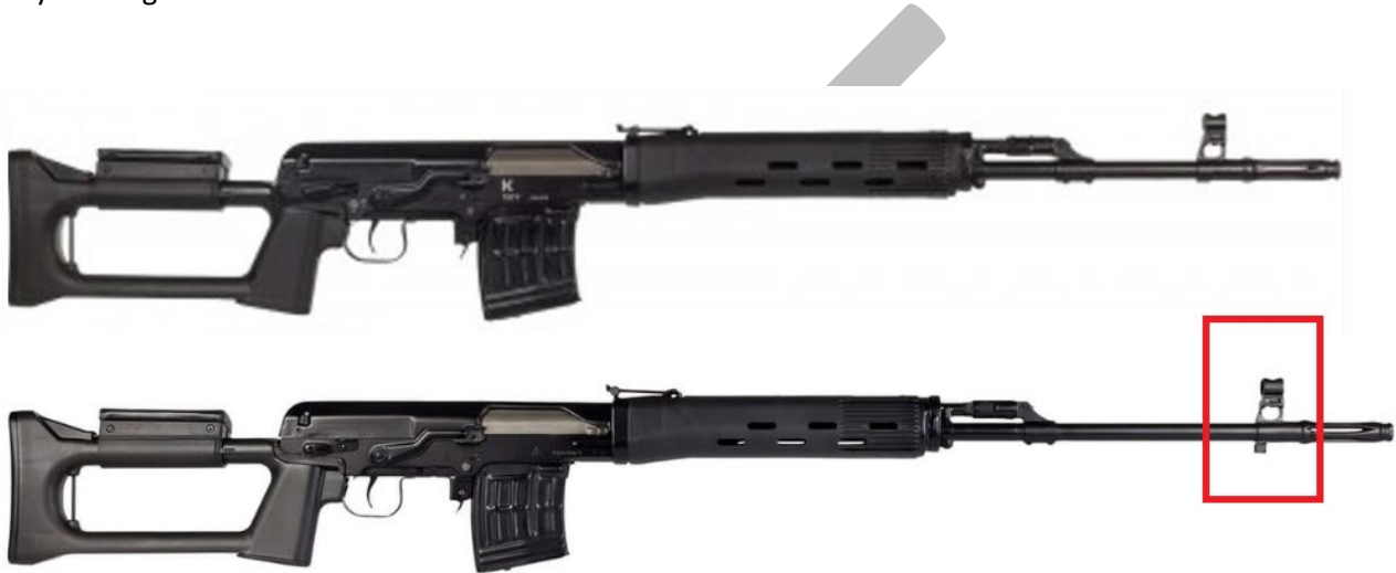
Above: A Tigr vers 1 (mod 2). 95

The Tigr, sometimes designated as “Tiger” in export markets, is the civilian variant of the SVD “Dragunov” DMR, manufactured by Kalashnikov Concern. The SVD and the Tigr differ mainly by the length of the barrel, the rifling twist rate, and by the absence of a bayonet lug under the front sights in the civilian variant. 93 Sudan manufactures its own version of the SVD, known as the ADY02 or Mokhtar-1, with the bayonet lug. 94