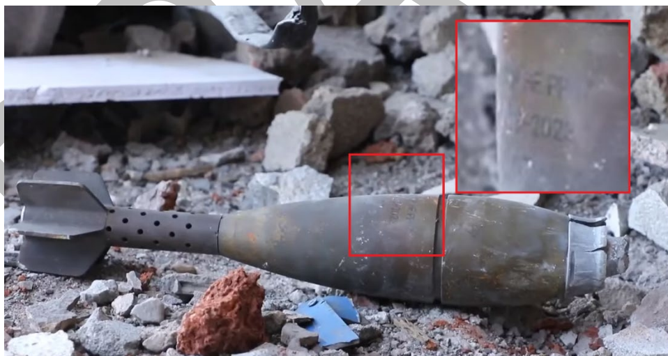
PP87 mortar found in Al-Daein in East Darfur, filmed by Al-Arabiya Television crew. 127

In a report from Al-Daein, East Darfur, Saudi news outlet Al-Arabiya shows a Chinese 125 mortar produced in 2023. Other 2023-manufactured PP87 mortars have been documented in other parts of the country: the RSF for instance seized a number of PP87 mortars from the SAF in November 2023. 126 Amnesty is not able to determine who used these mortar bombs in Darfur, or how they were imported into Sudan.