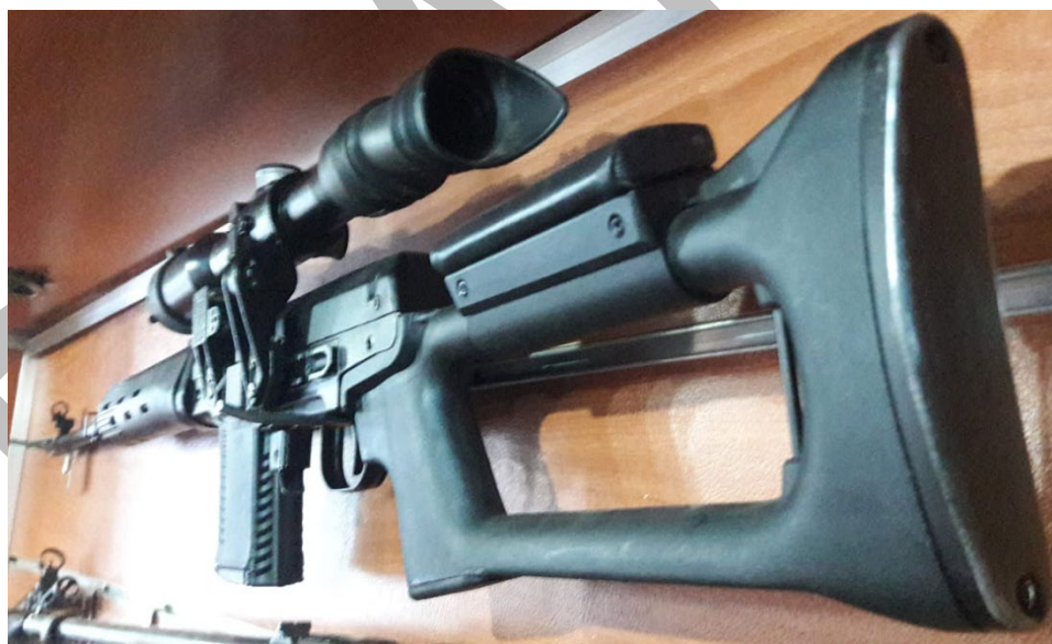
A Tigr DMR (.308 version) in the shop of an armourer in Khartoum that has purchased these rifles directly from Kalashnikov Concern. 92

Tigr Designated Marksman Rifles (DMR) are ubiquitous in the ranks of both the RSF and the SAF, almost everywhere in Sudan. Amnesty International was able to identify Tigr DMRs at least 24 times in videos shot in various parts of the country, including in Darfur. 91