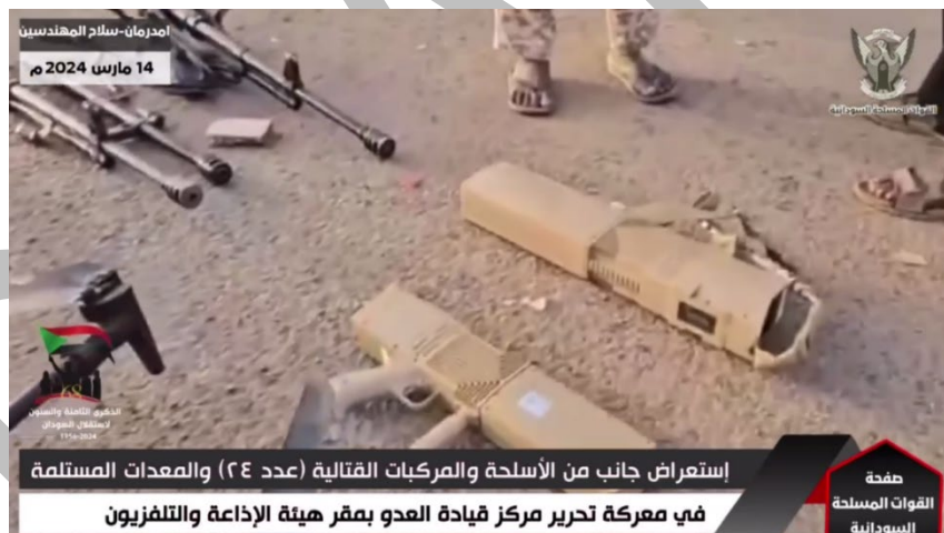
Drone jammers seized by SAF in Omdurman. 134

During the SAF Omdurman offensive in March 2024, after which the Sudanese Army claimed control of the national broadcasting building in Omdurman, several videos surfaced online showing drone jammer guns seized from the RSF. The vents pattern of these drone jammers match those produced by a 2010-founded, Shenzhen-based company, Ching Kong Technologies. Private photographs provided to Amnesty International researchers, show labels with a model number, CKJ-G7, that matches those of the CKJ Jammer series by Ching Kong Technologies 132 . The jammers seen in the pictures below appear to be an advanced version of those sold by Ching Kong Technologies on its website, as not only are they fitted with a handle, but based on the markings of the control panel, they seem to be able to interact with a wider range of frequency bands. These elements, in addition to the sand/camo finish, do suggest that the drone jammers seized in Omdurman were a military version of the CKJ jammers. 133 Amnesty International is unable to confirm if these were exported directly to Sudan or to another country in the region.