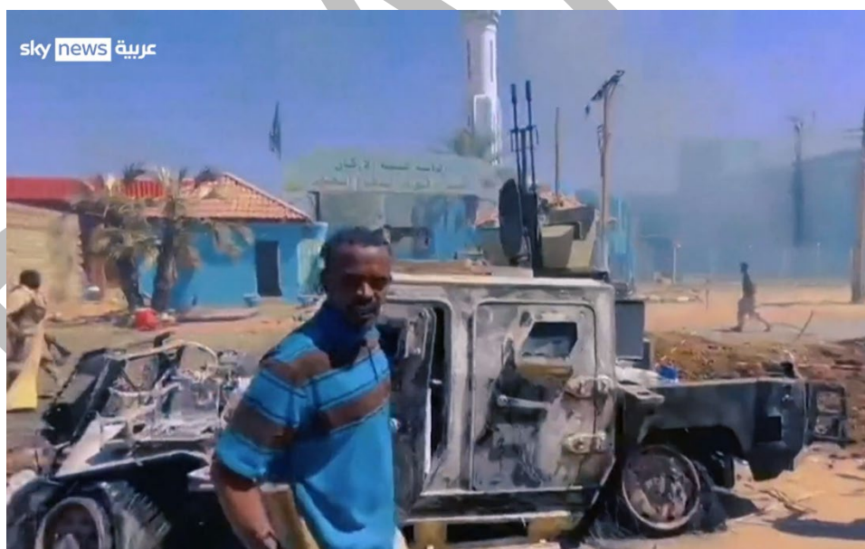
A destroyed NIMR Ajban in Khartoum. 154

Nimr Ajban APCs, first spotted in Sudan in 2019, 149 have been seen in videos verified by Amnesty International being used, by the RSF, in various parts of Sudan, including in Khartoum. 150 One video, first posted on 25 March 2024 on Telegram, in a location that Amnesty International was unable to independently verify, shows a man claiming to be a SAF soldier and speaking with a North Sudanese accent showing the mostly-illegible data plate from a Nimr Ajban seized by the SAF. 151 Numerous other types of Emirati APCs have been seen in videos in Sudan including at least one Shell Special Vehicles APC 152 . In April 2024, a video that the SAF claims to have shot in Mellit, North Darfur, shows several types of APCs allegedly seized from the RSF, including Streit Gladiator & Cougar APCs, a Terrier LT-79 and several INKAS Titan-S. 153 Contacted by Amnesty, the Armored Group (the manufacturer of the Terrier LT-79) claims to abide by all local and international export regulations and sanctions, including those imposed by the United Nations Security Council and unequivocally states it has never exported armored vehicles to Sudan. Shell Special Vehicles also stated that they have never exported Armored Personnel Carriers to Sudan.