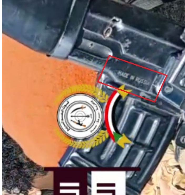
Screenshot of video highlighting “Made in Russia” markings on a Tigr DMR used by the RSF. 99

Tigr DMRs have been spotted in official RSF videos shot in South, East 100 and West Darfur 101 , in addition to West Khordofan, 102 Khartoum, Omdurman and other locations 103 . While it is impossible to verify when these models were manufactured and transferred - Tigr variants have been produced since the late 1960’s - based on several physical features, including buttstock variants, polymer furniture, and their general condition, several Tigr DMRs seen in videos are likely to be relatively recent purchases. Only physical inspection and tracing of the serial numbers on these Tigr DMRs would allow confirmation of this finding.