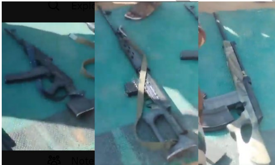
Left to right: a Molot Vepr 1V-E, a Tigr DMR and a Vepr.308 pattern rifle.

As with Saiga series rifles, Molot small arms are relatively difficult to identify in videos, due to their external resemblance with other AK-pattern rifles. One video, allegedly shot in Kassala 114 , a major weapons trading hub near the Eritrea border, shows two Molot rifles and two Tigr DMRs that have been captured by the SAF in the region. In this video are shown what are most likely a Vepr 1V-E and a Vepr .308-pattern rifle. The Vepr 1V-E is also known as “Vepr mini” or “Mini RPK” due to its large magazine and distinctive RPK-pattern buttstock. 115 In April 2024, digital evidence posted on the RSF’s official X account showed a Vepr 1V-E being used by its soldiers. 116 The caption of the video claims it was shot in Omdurman, which Amnesty is unable to verify.