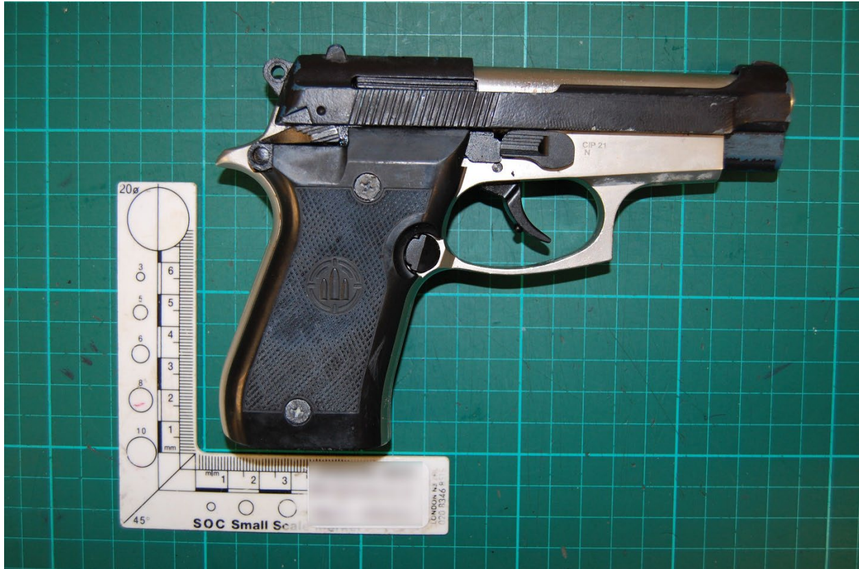
A converted Retay 84FS seized by British Law enforcement. 189