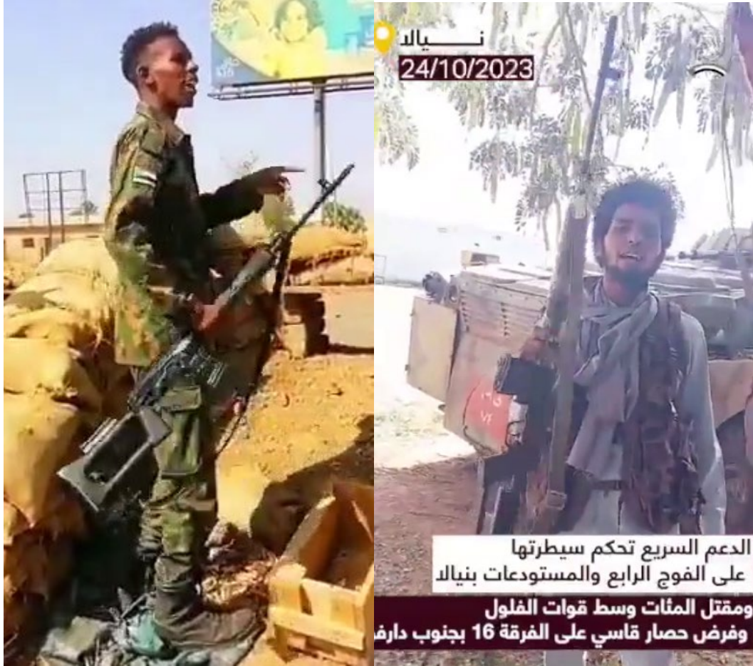
Edited screenshots of a videos showing a SAF soldier with a Tigr, near al-Nilin mosque in Khartoum 97 and an RSF soldier with a Tigr, in an RSF official video shot in Nyala (South Darfur) on the 24 th of October 2023. 98