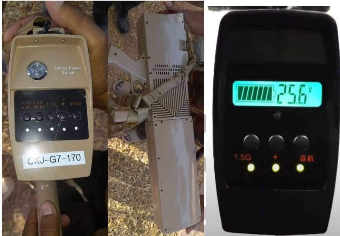
Left: Close-up of the drone jammers, with label marked CKJ-G7-170. 135