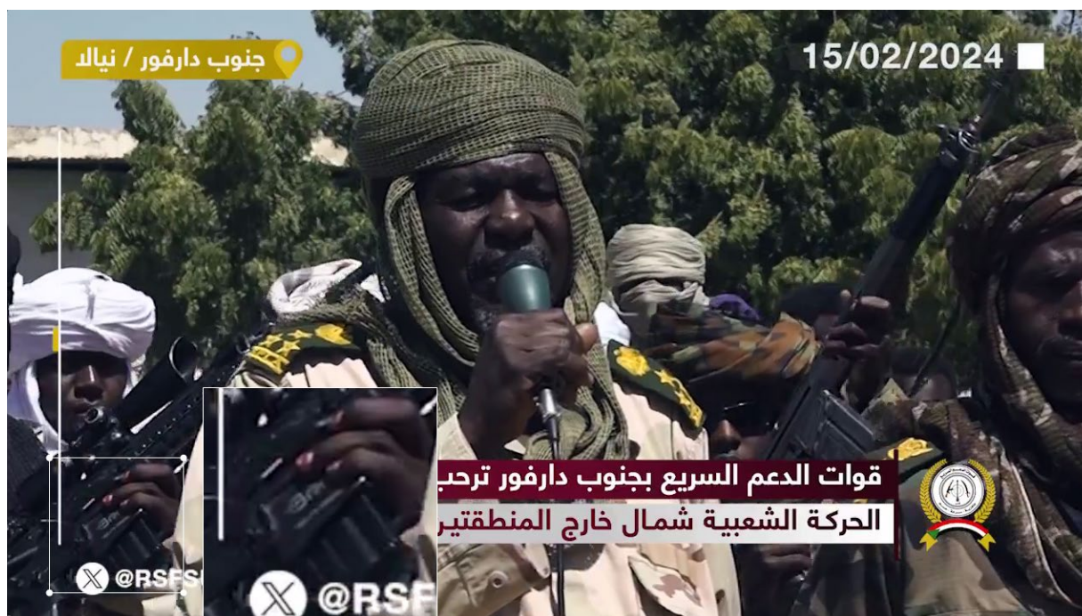
Edited screenshot of video posted by @Quick_news12 on X, with rifle highlighted. 66

value of USD 100,000. 63 All of these rifles have been imported into Sudan by a single exporter, referred to as “Osman Altigani Ali” in shipping records, 64 under the label “sporting rifles”. 65