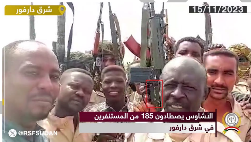
Modified G3 with Al-Marnz markings seen with RSF forces. 148