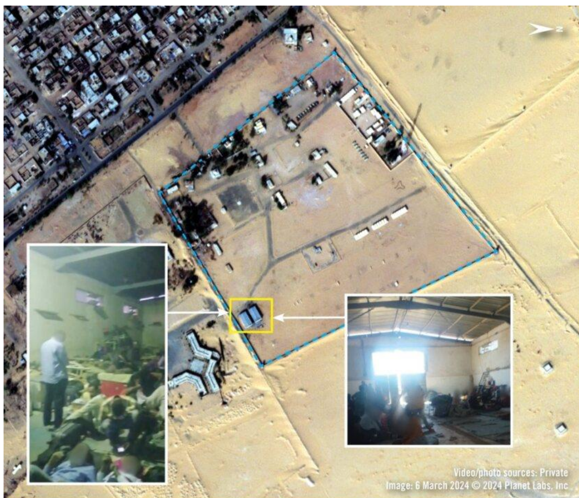
Video/photo sources: Private Image: 6 March 2024 © 2024 Planet Labs, Inc