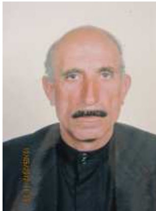
A 60 year old man, who was shot dead by soldiers in his home on 9 March 2012.

In the nearby village of al-Muwazzara, a woman showed Amnesty International her partially burned down home, where her 60-year-old husband (name withheld) was shot dead by soldiers on the morning of 9 March. He had been shot three times in the head and twice in the shoulder. His wife held up the headdress he had been wearing at the time, which had three holes at the top and two by the side, where it sat on his shoulder. She said: