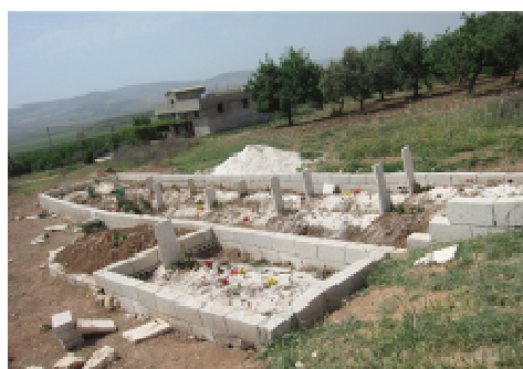
The 16 graves of the youths shot dead in a field on 16 February 2012.

“When the soldiers arrived they took 16 youths, one of them who was only 16, and dragged them to a field right opposite the houses and shot them dead. Four other youths who were trying to run away were also shot dead. Then the soldiers left but we could not pick up the bodies for one and a half hours because the army kept shooting into the village from up on the bridge.”