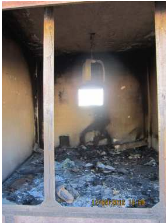
A burned-out family home in Jebel al-Zawya.

Resident of Jebel al-Zawiyah area, speaking to Amnesty International in mid-May 2012