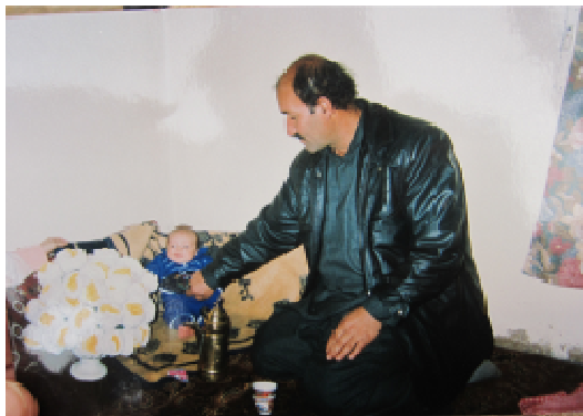
A 54-year old man who was set on fire by Syrian government soldiers.

Further south from Idlib, in the Jebel al-Zawiyah and Jebel al-Wastani area, residents of several villages described to Amnesty International how soldiers had taken their relatives from their home, shot them dead and, in some cases, burned the bodies.