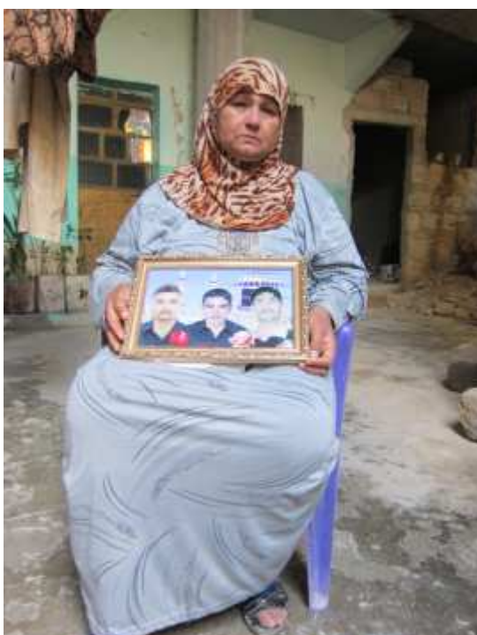
The mother of three brothers dragged from their home, killed and burned in Sarmin on 23 March 2012.

The patterns of abuses documented by Amnesty International in these areas are not isolated. Indeed, they have been widely reported elsewhere in the country, including in the attack by Syrian forces on Houla on 25 May 2012. According to the UN, 108 individuals, including 49 children and 34 women, were killed. 1 Some were killed during the shelling of the village by Syrian security forces using heavy artillery and tanks, the use of which was confirmed by UN