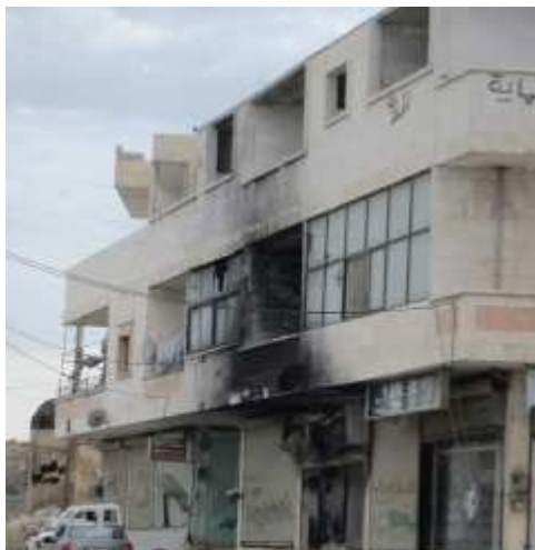
One of the pharmacies that was burned out in 'Anadan.