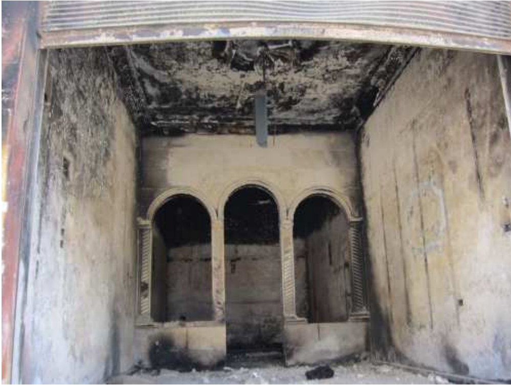
A burned-out shop in Sarmin.