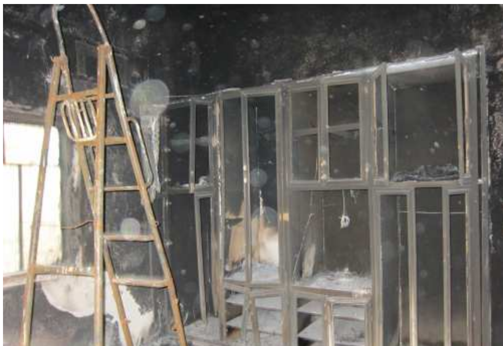
Inside one of the burned-out homes in Hazzano.

"I worked for the state for my whole life and I put all my savings into this house. Fourteen of us lived here, me and my wife and my sons and daughters and the children of my married sons. Now absolutely everything is gone. I have nothing other than these clothes I am wearing. They also burned the house next door which belongs to my brother's widow. My brother died three years ago and his wife lived in the house with her six children aged between 17 and 6 years old."