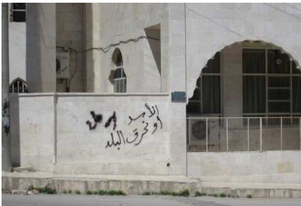
Graffiti left by soldiers in Idlib city stating: "Assad – or we will burn down the country".