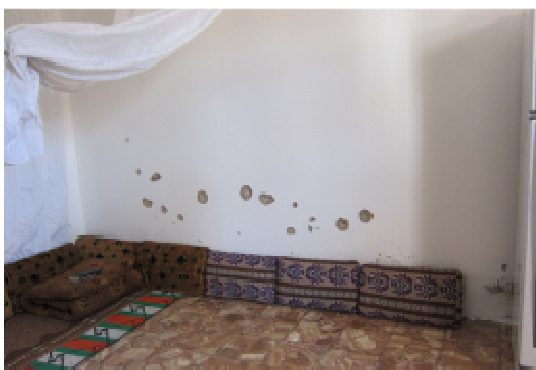
Bullet marks were visible in the reception room of the house where nine men were extrajudicially executed.

More than 20 male members of the Ghazal family, including at least one under the age of 18, were deliberately killed on 3 and 4 April in Taftanaz. Sixteen of them were taken from a basement, where they were sheltering with women and children. According to some of the women who were present at the time, the 16 were led outside by security forces, some in army uniforms and some in plain clothes, in the afternoon of 3 April. Later that evening their bodies were found at three separate locations near the basement.