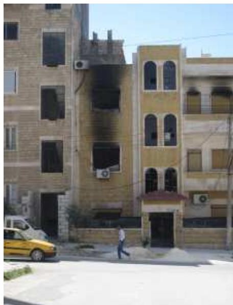
A burned apartment building in Idlib city.

"The neighbours saw it was Military Intelligence members who attacked my house. It was the middle of the day and there were tanks and soldiers and security forces members everywhere in the area; how on earth could this have been the doing of armed groups? So I did not lodge a