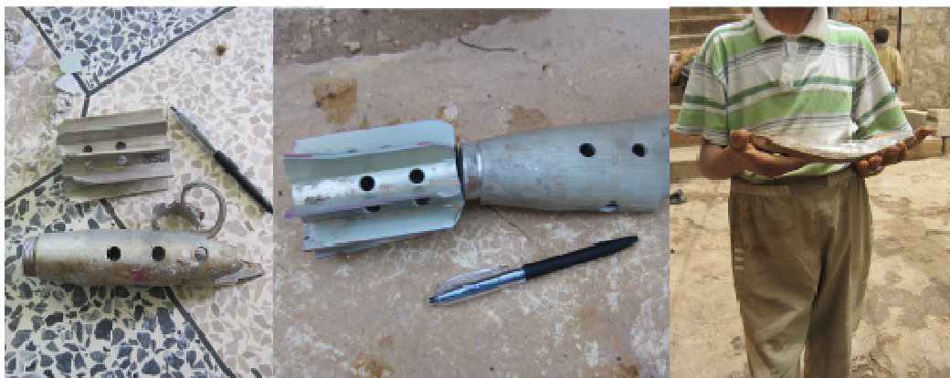
Remains of munitions were found in several homes in Taftanaz, Sarmin and al-Bashiriya.

“Nawal and her husband were sitting in the living room, which opens into the internal courtyard of the house. It was about 1.15pm when a shell came over the courtyard, struck the roof of the porch and slammed into the living room. Nawal was hit and killed on the spot; she had horrific lacerations.”