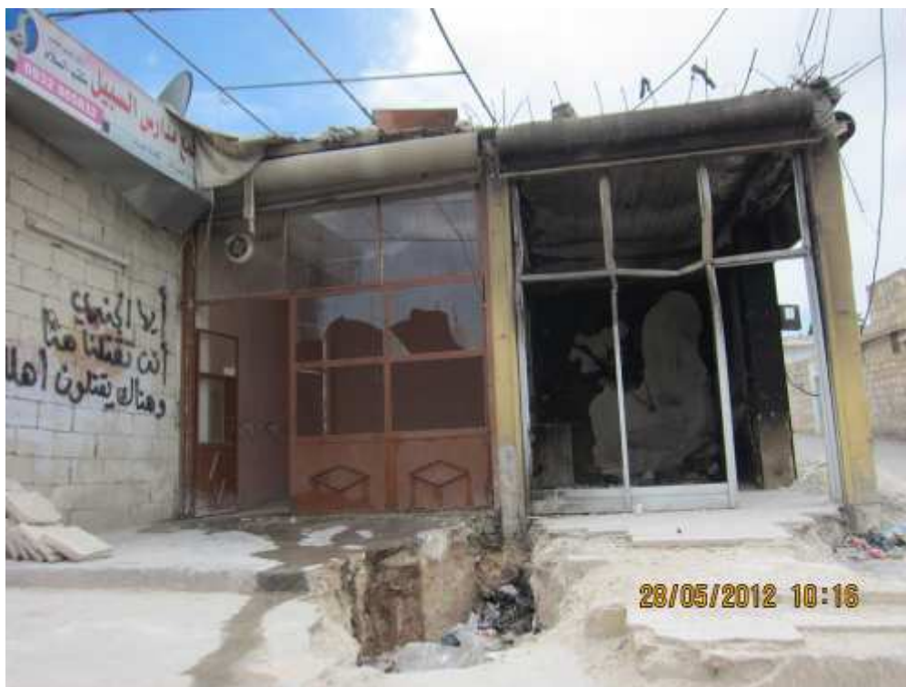
Burned and looted shops in Anadan.

"My brothers are with the thuwwar [armed opposition] but the soldiers burned down my grandmother's house, one floor above ours. I think they probably wanted to burn our home and got it wrong."