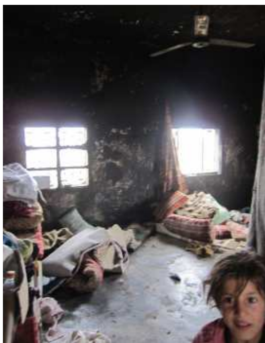
A family living in the remains of their burned-out home in al-Bashiriya.

In recent months, the situation appears to have evolved into an armed conflict in parts of the country. As armed confrontations between government forces and armed opposition groups have become more common, the frequency and brutality of government reprisals against towns and villages supportive of the opposition has escalated, in an apparent bid to punish the inhabitants for their known or suspected support for armed opposition groups, and to frighten them into submission.