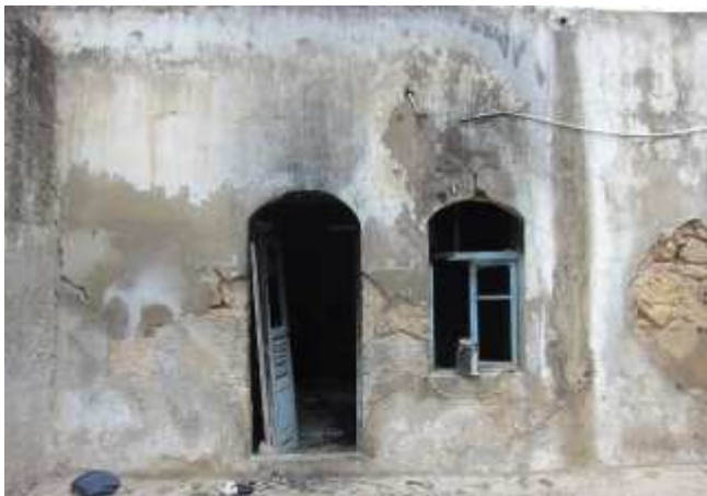
A burned-out field hospital in Sarmin.

The manner in which the arson attacks were carried out indicates premeditation. Incendiary devices were used, causing intense fires, even where there had been little flammable material in the houses. The damage was overwhelming – wall-to-wall and floor-to-ceiling – indicating that the fires were fed by highly flammable chemicals. The troops must have brought with them incendiary devices that served no other purpose than to start fires.