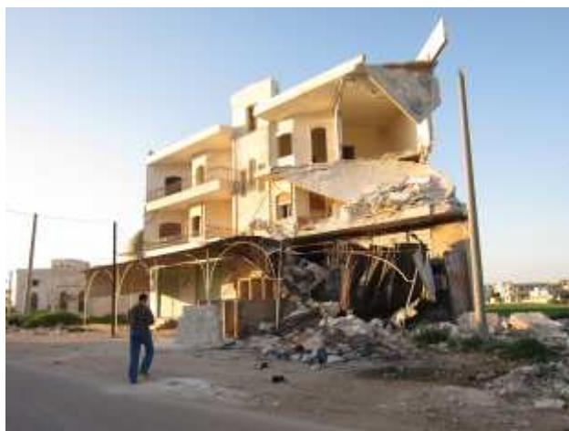
A destroyed house in Taftanaz.

While it has been predominantly men and boys who have been the targets of extrajudicial executions, hundreds of bystanders not involved in the conflict have been killed and injured as a result of indiscriminate shooting and shelling by Syrian armed forces, both in the context of military incursions and attacks, and at other times. During visits to towns and villages around Idlib and in the Jebel al-Zawiyah area, an Amnesty International delegate witnessed several instances of indiscriminate shooting from army positions.