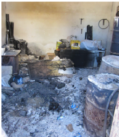
A small room near a field hospital, where five burned bodies were found. Three of these are believed to be members of the Ghazal family.

home in an adjacent room told Amnesty International: