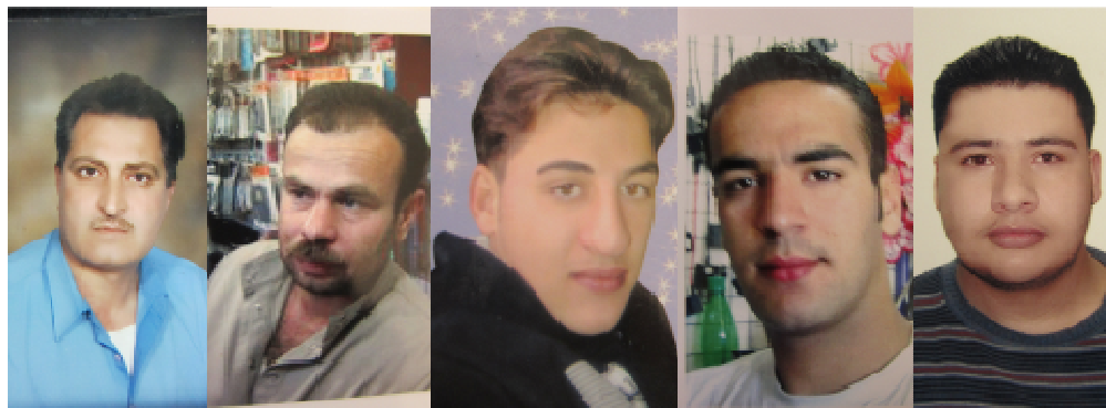
Five of the 20 men who were shot dead on 16 February.

a construction worker, from the family home at 5am. His body was found the following day, together with the body of another villager also arrested the previous day from the village, near the military camp in Eblin, a few kilometres south of the village. The body of a third villager, a father of seven, who was taken from his home on 3 February, was also found near the Eblin military camp two days later. His relatives told Amnesty International that he had been shot in the leg at his home before being taken away.