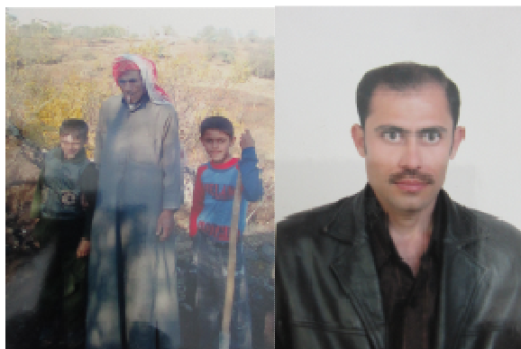
A 72-year old man and his 27-year old son were deliberately killed on 7 April 2012.

"A group of soldiers came to the house; my son was sitting drinking mate (a sort of herbal tea). They took his ID, looked at it and tore it up and took him away. I was petrified; I was afraid that they would beat him or imprison him, but I never imagined that they would kill him. After the soldiers left, his body was found by the main road, about 500 metres from our home."