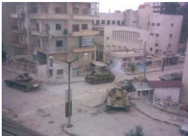
Tanks in Idlib city on 13 March 2012.

“We were at home; there was shooting and shelling everywhere and we did not know where to go for safety. In the morning soldiers came and took my nephew. They did not say anything and only had a quick look around the house; they did not carry out a detailed search. We did not dare to ask them anything and thought they would question him and release him.”