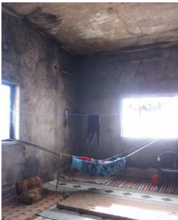
A baby sleeping in the burned-out home of a family in Taftanaz.

"I went to work at the hospital on 3 April and remained there overnight because there were no doctors in the hospital. There is only one doctor in Taftanaz and he was not there. There is no surgeon in the town so I do the stitching and many other tasks. On 4 April I was trying to call home but there was no reply and I presumed that my wife and the children had gone to stay with relatives because of the situation. Then people told me my house had been burned down. I did not imagine it could be this bad. The savings of my whole working life were in this house. Now there is nothing left."