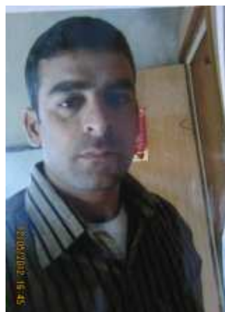
A man from al-Lej, who was taken by soldiers on 19 December 2011. His body was found on the same day, blindfolded and handcuffed at the back.

"Soldiers took my husband from home at about 9.30am and a few hours later his uncle went to ask about him at the army camp in the nearby village of Arnaba. Soldiers there told him to wait until the unit from Bellioun (a nearby village) came and that he had probably been taken to Bellioun and that if nothing was found against him he would be released before sunset. When the army left the village in the evening people from the village said they had found three bodies blindfolded and handcuffed at the back. One of them was my husband."