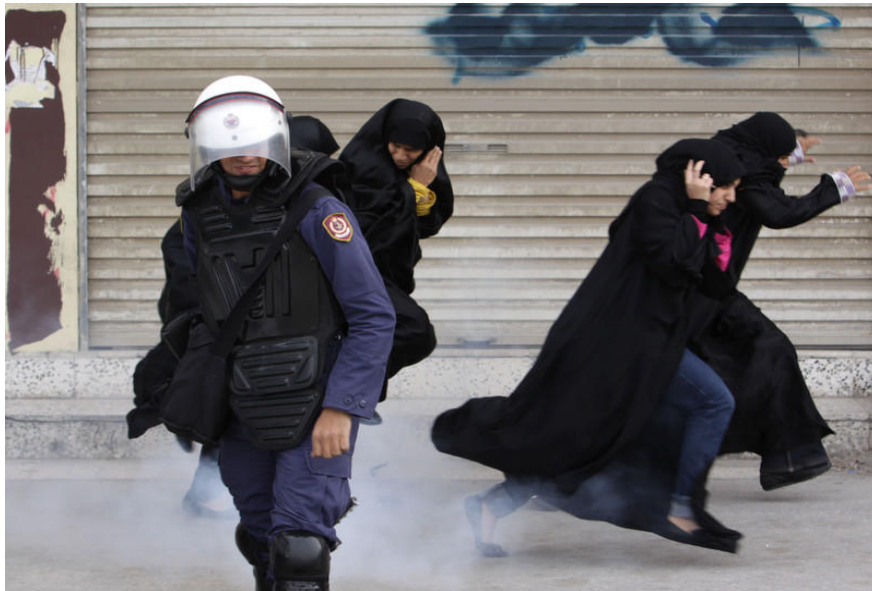
Bahraini anti-government protesters react as riot police throw sound bombs at their feet to disperse them Friday, Feb. 17, 2012

Ali Hussein Neama’s family member, September 2012