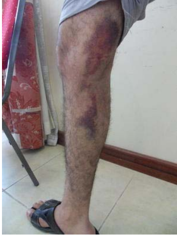
Marks on the leg of a former detainee who alleged torture. Bahrain, April 2011

In June 2012, the newly formed BICI Follow-up Unit issued a report documenting the progress made in implementing the recommendations of the BICI report. According to the BICI Follow-Up Unit's report issued in June 2012, in addition to 122 cases referred by the Ministry of Interior (MoI) and the National Security Agency (NSA) in February 2012, the SIU received an additional 45 complaints. Some 126 complainants were interviewed and 50 of them referred for forensic medical examination. Seventy-seven suspects were also questioned and investigations resulted in charges being brought against 21 policemen and officers. 6