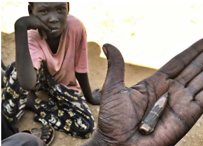
A child looks on as a traditional healer shows a high-calibre bullet that he removed from the stomach of a woman who was shot 10 July 2016 at one of the UN's protection of civilian sites.

Some victims survived despite suffering potentially deadly injuries. A 27-year-old woman was hit by two high calibre machine gun bullets at 9 am on 11 July, while she was inside her shelter in POC 3 preparing food for her family. 28 One round hit her in the leg, badly damaging the bone, the other hit near her heart. Brought to the clinic in POC 1, she was operated on by a traditional healer on 12 July without anaesthesia. Eight days later, she was operated on by a trained surgeon. When an Amnesty International delegate met her at the clinic in mid-August, she was still extremely tired and confined to her bed, though beginning to heal.