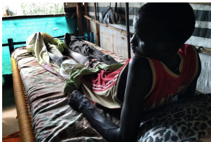
A Nuer man who was badly injured in the leg by indiscriminate fire on 11 July 2016 at one of the UN's protection of civilians sites in Jebel. More than a month after the attack, he was still recovering.