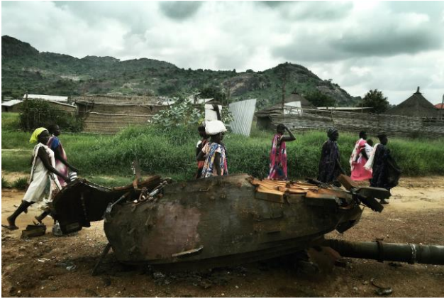
Women walking past a destroyed tank on Yei road, near the checkpoint where many dozens of women were raped by government soldiers in mid to late July 2016.

A 45-year-old woman who witnessed the rape of two younger women on the Yei road on 15 July told Amnesty International: “I blame the UN. They were right there, driving nearby, as women were being beaten. We thought maybe they were coming to rescue us, but they didn’t.” 71 According to her account, two UN armoured vehicles drove close to where the group of women were being held by SPLA soldiers—perhaps 100 meters away—but turned onto the road to the eastern gate of the UN base rather than continuing toward them. Several sources told Amnesty International that UN armoured vehicles are barred by the government from crossing the military checkpoint on that road. 72