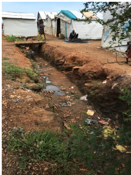
A drainage ditch in which dozens of people took shelter from indiscriminate fire at one of the UN's protection of civilians sites in Juba's Jebel neighbourhood.

Most egregiously, opposition fighters were reported to have entered the protection of civilians sites in Jebel several times on 10 and 11 July, at least once in large numbers. It is not clear whether in doing so the fighters intended to shield themselves from attack or impede military operations—which would constitute the war crime of using human shields—but regardless of their intention, the impact of such maneuvers was to endanger the thousands of civilians sheltering in the sites. By deploying in and around the protection of civilians sites, and by, in some cases, abandoning their weapons and taking shelter in the sites themselves, opposition forces also bolstered the perception that the sites serve as rebel sanctuaries.