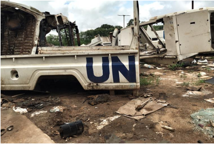
The looted WFP compound in Juba's Jebel neighbourhood. More than 4,500 metric tons of food was stolen from the compound, enough to feed about 220,000 people for a month.