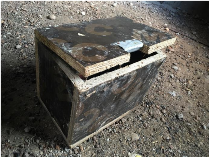
An empty wooden savings box, broken into by government soldiers who carried out massive looting in the Munuki neighbourhood. The family that owned the box lost more than a year's worth of savings.

Several markets were also looted, including the Jebel market, Gudele market, Customs market, and Juba Nabari market. A business owner based in the Jebel market said that he saw troops from the presidential guard, known as the Tiger Division, breaking into shops on 10 July and carrying goods away on their vehicles. 55 He claimed that he had lost his entire capital investment, and that many other business owners had fled the country.