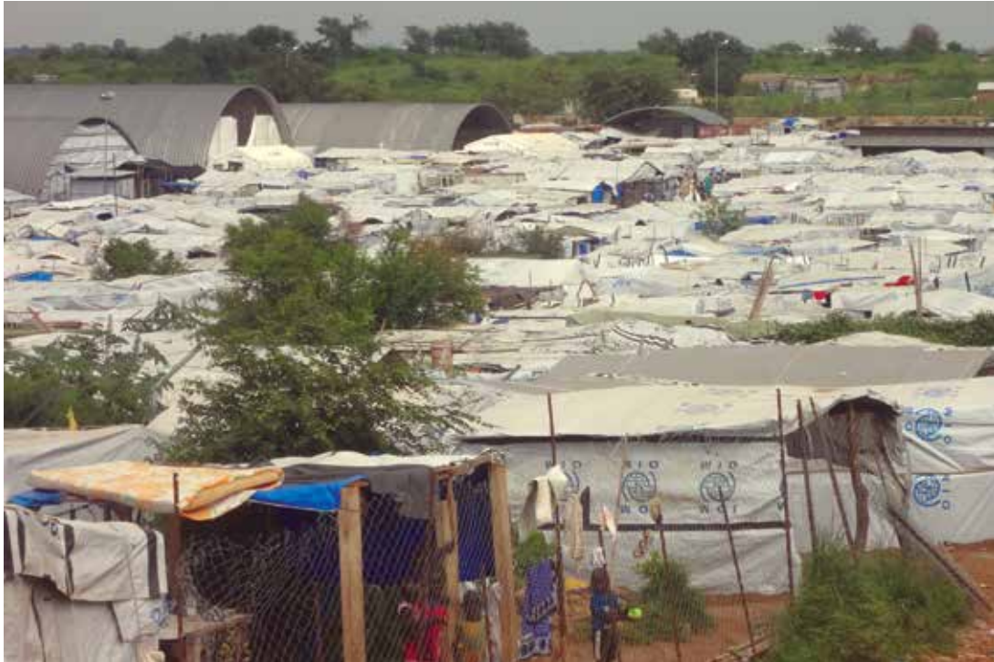
UNMISS PoC site in Juba, South Sudan. 2014

I tried to go to school here but found that I could not concentrate even on the easy things. They just opened a school here, but my thoughts distract me. When I sit still, my mind just goes to other things like my children.”