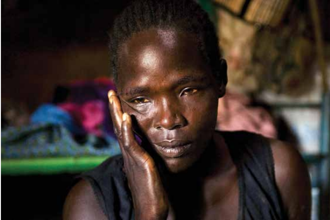
A woman whose husband was killed by an unknown armed group the previous night. Gumbo, Central Equatoria state, 2006