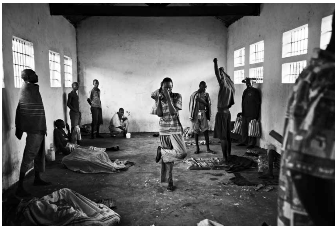
People with suspected mental conditions are routinely detained in prisons. Juba Central Prison, Juba, South Sudan, 2011.

The routine use of prisons to house individuals with mental health conditions is a stark manifestation of the inadequacy of mental health treatment, stigma about mental disorders and the deficit of facilities and trained staff. Individuals with mental health conditions deemed to pose a danger to themselves or others often end up arbitrarily detained in prison, even if they have not committed any crime. They may be transferred to prison from medical facilities or taken directly to prison by family members who feel unable to care for them. In May 2016, there were 66 male and 16 female inmates in Juba Central Prison categorized as mentally ill, more than half of whom had no criminal files. 92 According to a former health worker at Malakal Hospital, prior to the conflict, there were 27 people with mental health problems in the Malakal prison. “Some were brought to prison by family members because they were violent, aggressive, and suicidal,” he explained. 93