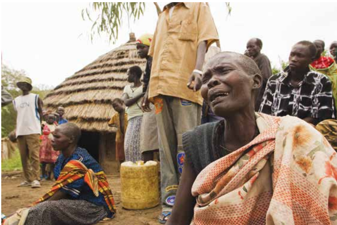
A woman cries following a deadly attack by cattle raiders. Chukudum, Eastern Equatoria state, 2007

The armed conflict that erupted in December 2013 is only the most recent episode of violence in South Sudan's history. From 1956 to 1972 and again from 1983 to 2005, the Government of Sudan and pro-government militias fought against armed groups who sought greater equality and autonomy for the southern regions of Sudan. Both periods of civil war were characterised by extreme violence against civilians, gross human rights abuses, and massive forced displacement. During the second civil war from 1983 to 2005, an estimated 1.9 million people—one out of every five southern Sudanese—were killed or died from disease and famine, and some four million people were internally displaced. 2