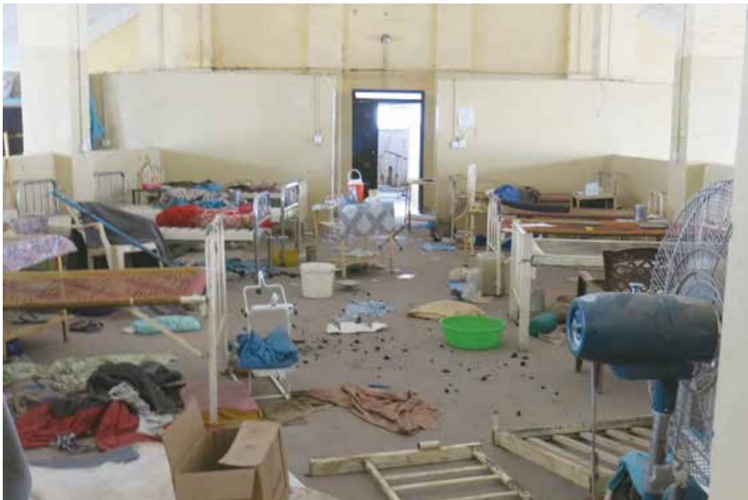
A ward in Malakal Teaching Hospital, where patients and displaced people who had taken refuge were killed by opposition forces in late February 2014. Malakal, Upper Nile state, March 2014.

“She can't manage—she's not normal. She can talk but it's senseless. She quarrels with the children. She cooks, but like a child, she burns things. She knows the children's names, but she does not know their ages. It is the children who tell her to do the things she should do. She can't identify what is happening...Sometimes I pray to God to help her.” 51