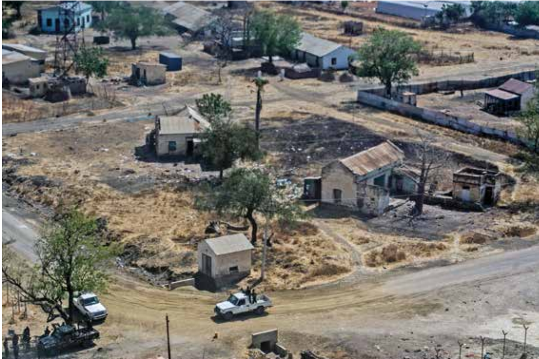
A view of the deserted streets in Malakal, Upper Nile state in January 2014 after residents fled violence between government and opposition forces.

Ajak fled to the Malakal UNMISS base on 25 December 2013, during the first attack on Malakal by opposition forces.