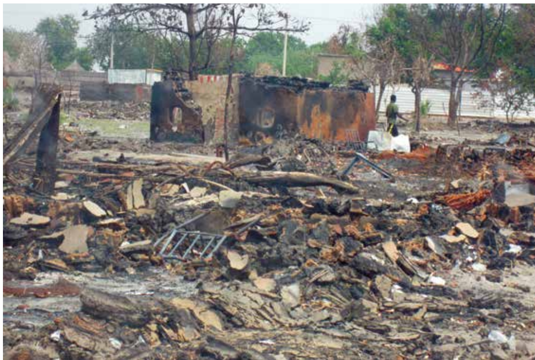
The conflict resulted in the destruction of homes, hospitals, and other buildings. Bentiu, South Sudan, March 2014.

In December 2013, growing political tension between President Salva Kiir and Dr Riek Machar mushroomed into a brutal internal armed conflict. 4 Fighting started in Juba, the capital, where government forces engaged in targeted killings, primarily of Nuer men. Security forces across the country split—with some maintaining allegiance to the government and others defecting to support the armed opposition under Machar, which came to be known as the Sudan People's Liberation Movement/Army-In Opposition (SPLM/A-IO). By the end of 2013, the conflict had engulfed parts of Jonglei, Unity, and Upper Nile states. 5