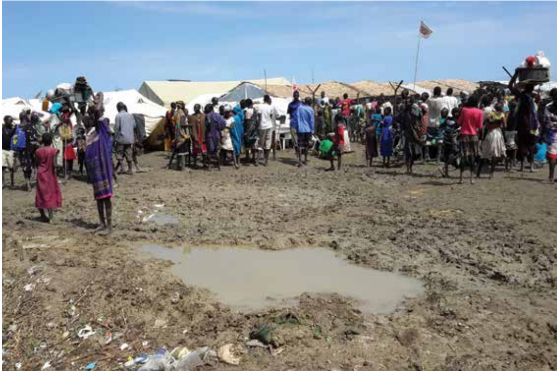
Newly arrived internally displaced people register at UNMISS PoC site in Bentiu, Unity state, May 2015.