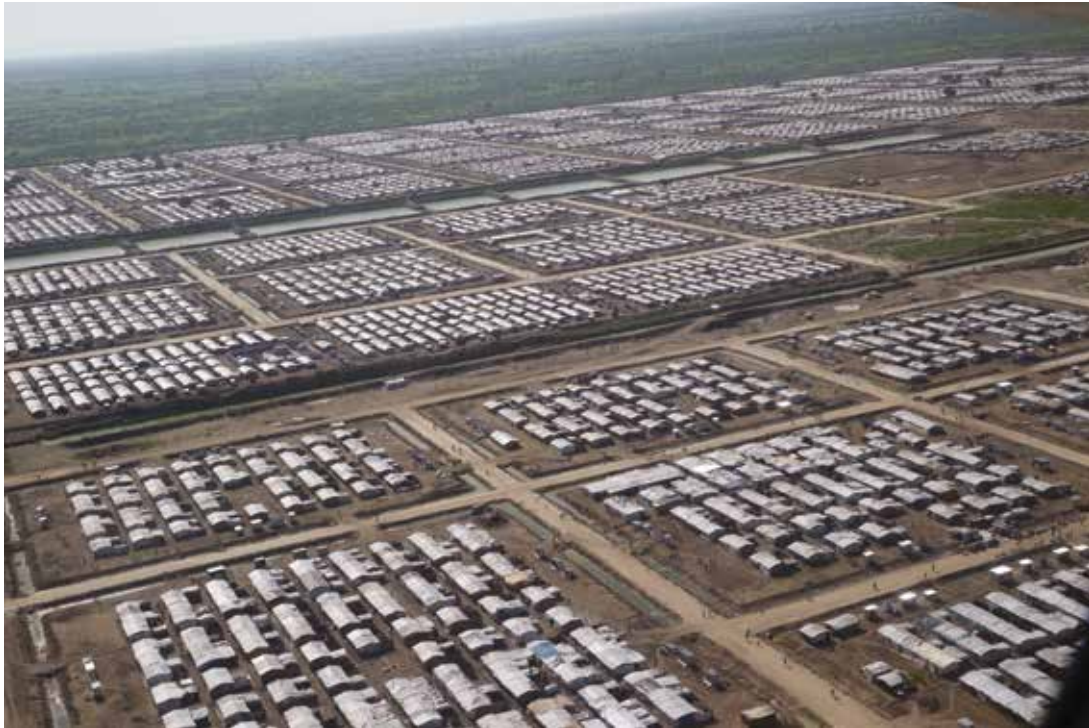
Aerial view of the UNMISS PoC site in Bentiu. June 2016.

Nyawal sought refuge in the Bentiu PoC site in early 2015, escaping an attack on her village in Guit county. She was raped by an SPLA soldier a few months after arriving at the PoC site when she ventured out to buy medicine.