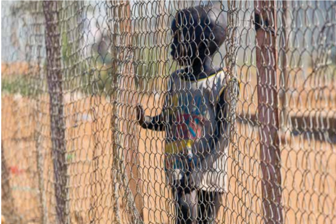
A child at the UNMISS PoC in Juba. 2015

"I am unable to sleep. My wife appears in my dreams. Sometimes she blames me for not performing the required funeral rites...I didn't go to church; I blamed God. When I would go to church I would just cry. My wife used to sing in church. I would remember her voice, how she used to sing."