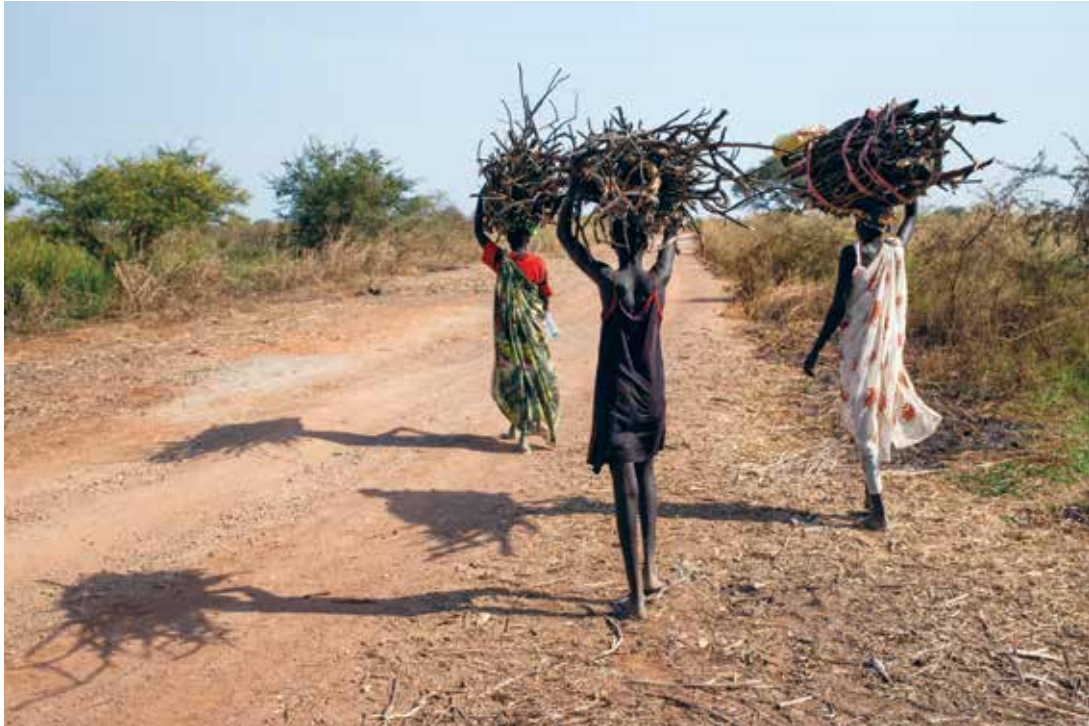
Women returning with collected firewood to the UNMISS PoC site in Bentiu, January 2015.

Nyawal was treated for her rape by Médecins Sans Frontières (MSF) and also received support from the International Rescue Committee (IRC), which provides counselling for survivors of sexual violence in the Bentiu PoC. Her experience caused her significant mental anguish.