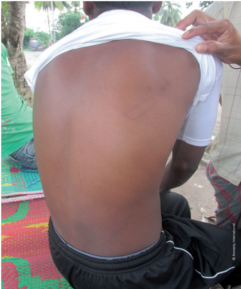
A 21-year old Bangladeshi man showing a scar he said he sustained from severe beatings on board a large vessel that stayed near the Thai coast for seven months.

Between 9 May – when the Arakan Project reported that smugglers had abandoned several vessels, leaving thousands stranded at sea – and 20 May – when the governments of Indonesia and Malaysia agreed to offer temporary shelter to up to 7,000 people – journalists, UN agencies and human rights organizations highlighted that the Indonesian, Malaysian and Thai governments were engaged in “maritime ping-pong” with human lives, pushing back boats from their shores. 126 Binding non-refoulement obligations, discussed earlier in this report, preclude states from engaging in these types of “push-backs,” because these operations carry an inherent risk of people being sent to a place where they might suffer serious human rights violations.