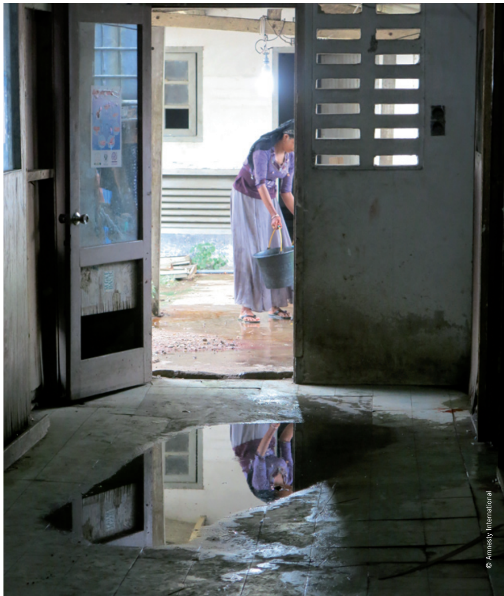
The hallway of the women's quarters at a shelter for Rohingya asylum-seekers in Aceh.

Several weeks after Amnesty International's research at the Blang Adoe shelter in Aceh, there were media reports about the beating and rape of the Rohingya by local residents. Following the alleged rapes, including of a 14-year old girl, more than 200 Rohingya left the shelter but eventually returned. At the time that this report was being finalized in mid-October 2015, local police said that they were investigating these reports. 181