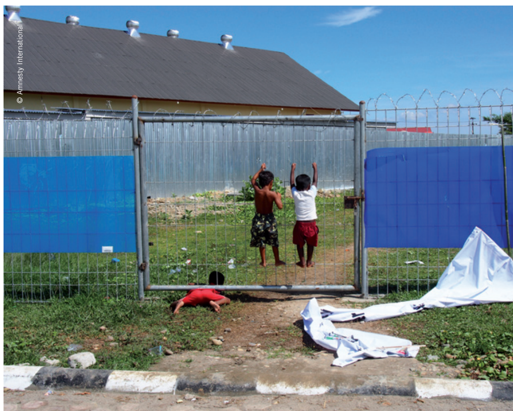
Three Rohingya boys at a shelter in Aceh.

A large proportion of the recently arrived Rohingya are children; of a population of 950 people, 521 – or 55% – are children, and 328 – or 34% – are unaccompanied or separated. 176 Although the sites where the Rohingya are living in Aceh are not officially called detention facilities, in practice the residents’ movements are often restricted and they could be understood as being detained. Amnesty International is concerned at the ongoing detention of any children, as detention is never in their best interests. 177 The long-term effects of immigration detention on children are well known; in one recent study, a third of children detained by Australia were suffering from a mental health disorder requiring psychiatric support. 178