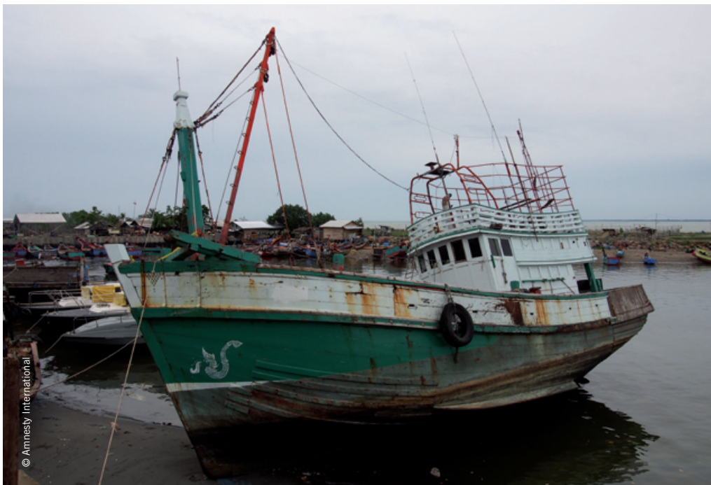
One of the three boats to reach Aceh in May 2015. It carried 578 Rohingya and Bangladeshi passengers, who were rescued by local fishermen.

In May 2015 three boats carrying 1,800 women, men and children grounded in Aceh in Indonesia. The vessels were among the many boats that had been abandoned by their crews following the regional crackdown on trafficking, leaving thousands of passengers stranded at sea for weeks. The majority of those on the boats were Rohingya who had fled Myanmar. All those who arrived at Aceh were weak with hunger, exhaustion and fear. They had endured weeks or months at sea, in boats controlled by ruthless people traffickers or abusive smugglers. This chapter discusses the conditions they were fleeing in Myanmar.