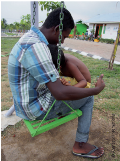
A Rohingya man and child at a shelter in Aceh.

In May 2015, Indonesia permitted the disembarkation of approximately 1,800 people in Aceh who had been stranded at sea in three boats. Of this group, UNHCR registered about 1,000 Rohingya asylum-seekers from Myanmar, 143 115 of whom spoke with Amnesty International. The remaining passengers were determined to be Bangladeshi migrants, and their gradual repatriation is being carried out with the assistance of IOM. As of 10 August 2015, the recently arrived Rohingya were being housed in five locations in Aceh and North Sumatra provinces: 315 in Lhokseumawe, 102 in Kuala Langsa, 159 in Lhok Bani, 331 in Bayeun, and 43 in Medan. 144