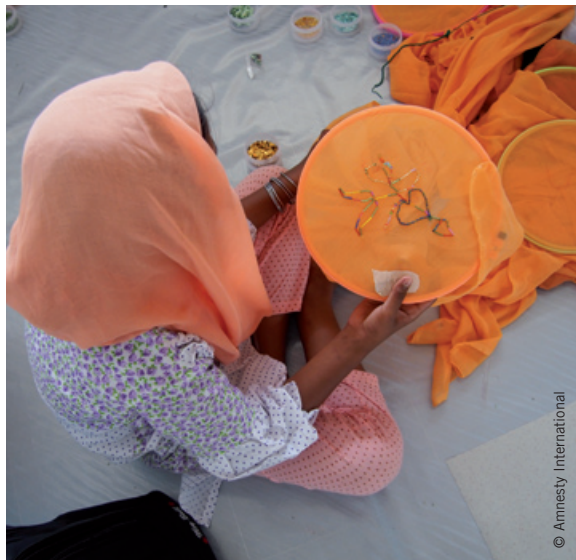
A Rohingya girl practising her embroidery at a shelter in Aceh.