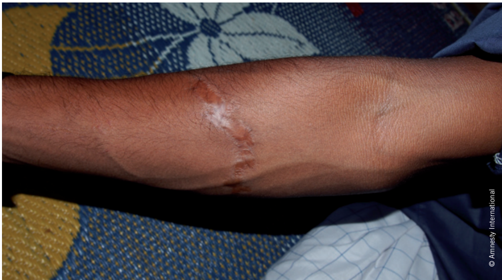
A Rohingya man showing a scar he said he sustained from a knife attack that took place in Myanmar in 2012.

Several interviewees said that their family members were killed and/or disappeared during the 2012 violence. A Rohingya businessman from Molek told Amnesty International that his 50-year old aunt was killed by police in June 2012; an eye-witness told him that she was stabbed with a knife in her side, and her body was taken to the monastery but never released to her family. At around the same time, his two teenage nephews were captured by a mob and never seen again. He called the police to inquire about his nephews' whereabouts, but the officer told him: “ Kala , I cannot do anything for you.” 31 A 19-year old woman from Sakki village said that in June 2012 her husband received knife wounds during the attacks, and she believes he died: “We cannot find his dead body. It disappeared.” 32 A woman from Santolli village told Amnesty International that her eight- and seven-year old children disappeared during the June 2012 violence; she fears that they are dead, saying: “I never saw their bodies.” 33