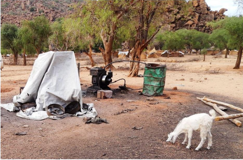
The site of the grinding mill in Tunguli, Dalami County, attacked on 7 April 2015