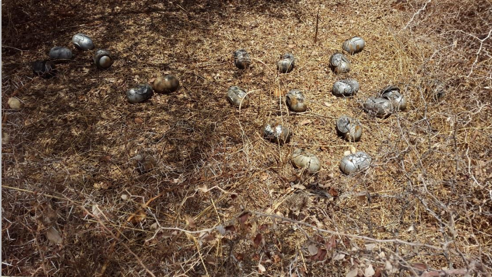
Unexploded cluster bomblets in Rigivi, Umm Dorain County

Since the Sudanese Air Force's acquisition from Belarus in 2013 of Sukhoi Su-24 ground attack aircraft they have been using parachute bombs with increasing regularity in South Kordofan. Those documented previously have been Soviet/Russian origin FAB-500 series bombs. The size and dimensions of the crater along with the remains of charred fabric straps at the site of a bomb dropped outside the Kauda Peace High School for Girls in February 2014 are indicative of a parachute retarded aerial bomb of around 500 kilograms. Similarly, the unexploded bombs on and immediately outside the grounds of the Kauda Rural Hospital are indicative of a parachute retarded high explosive general purpose bomb of between 400 and 500 kilograms. Stencilling visible on one of the weapons, if correct, suggests that it was probably manufactured in the 1960s. On the basis of the script and the lot numbering, it is possible that these are Chinese-manufactured parachute-drag tail assemblies.