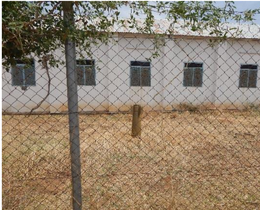
One of the three unexploded ordnance at the front of Kauda Rural Hospital

Amnesty International researchers inspected three unexploded ordnances at the Kauda Rural Hospital. The unexploded ordnances are indicative of a parachute retarded high explosive bomb. Witnesses said that the hospital was attacked on 28 May 2014, the same day as the attack at the Saint Peter and Paul School in Gidel. One of the ordnance, nose down in the ground, is on the grounds of the hospital, behind the chain link fence that surrounds the property and less than three meters from one of the hospital buildings. The other two ordnances are just outside the fence, no more than 20 meters distant. Fortunately since they did not explode there was no loss of life, injury or damage to property. The hospital was not operational at the time, having been evacuated several months earlier because of fears of a possible attack. It remains closed.