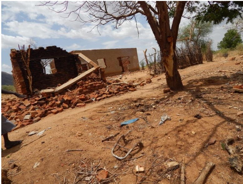
Six children were killed in this house on 16 October 2014 in Heiban town, Heiban County

Children have frequently been killed and injured in attacks in South Kordofan. On 16 October 2014, a bomb hit a house in the village of Heiban in Heiban County in which seven children between the ages of five and 12 were hiding. Six of the children were killed immediately or died shortly after the attack from their injuries. Only one child survived the injuries sustained during the attack. The children's mother was farming in a nearby field at the time.