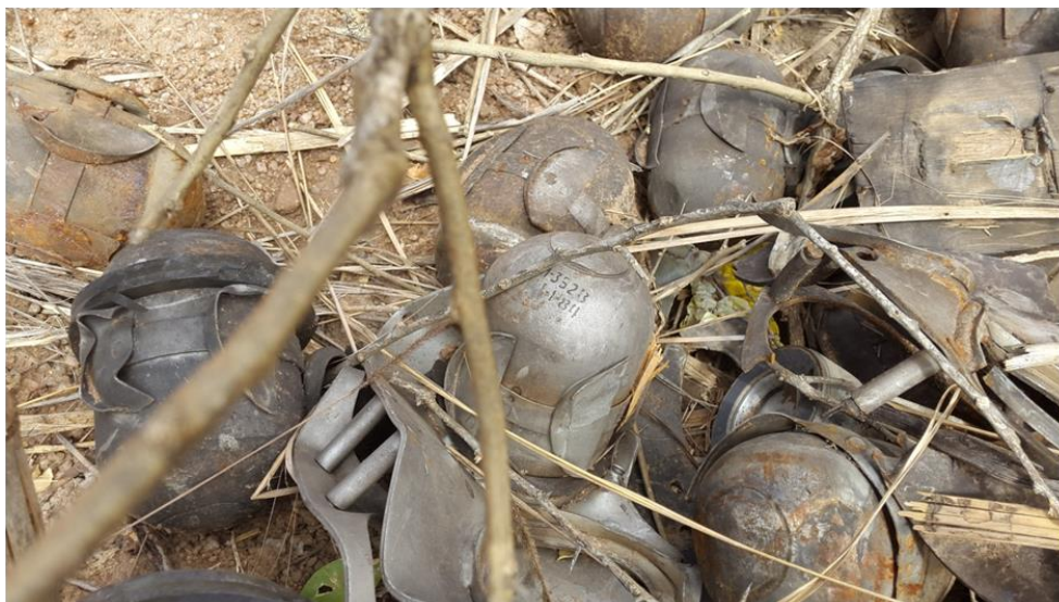
Bomblets from the cluster bomb inside a house in Andona village, Dalami County