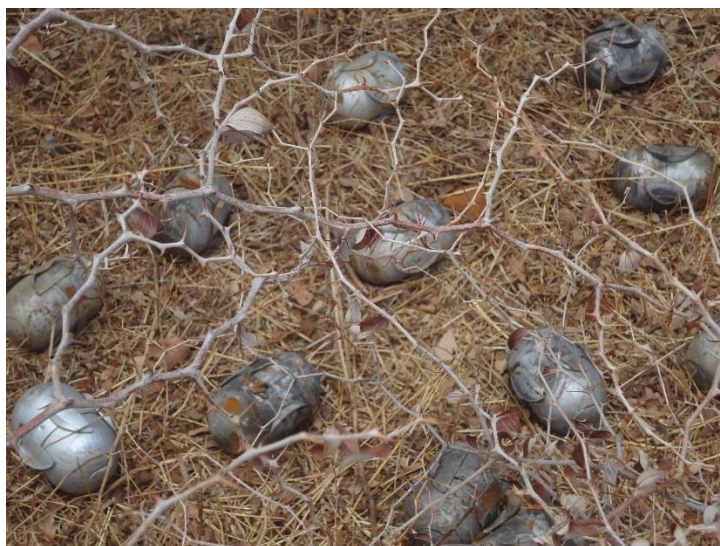
Evidence of unexploded cluster bomblets in Umm Dorain County

Amnesty International has also confirmed the use of cluster munitions and the resulting presence on the ground of unexploded cluster bomblets at four sites in two separate locations in Dalami and Umm Dorain Counties.