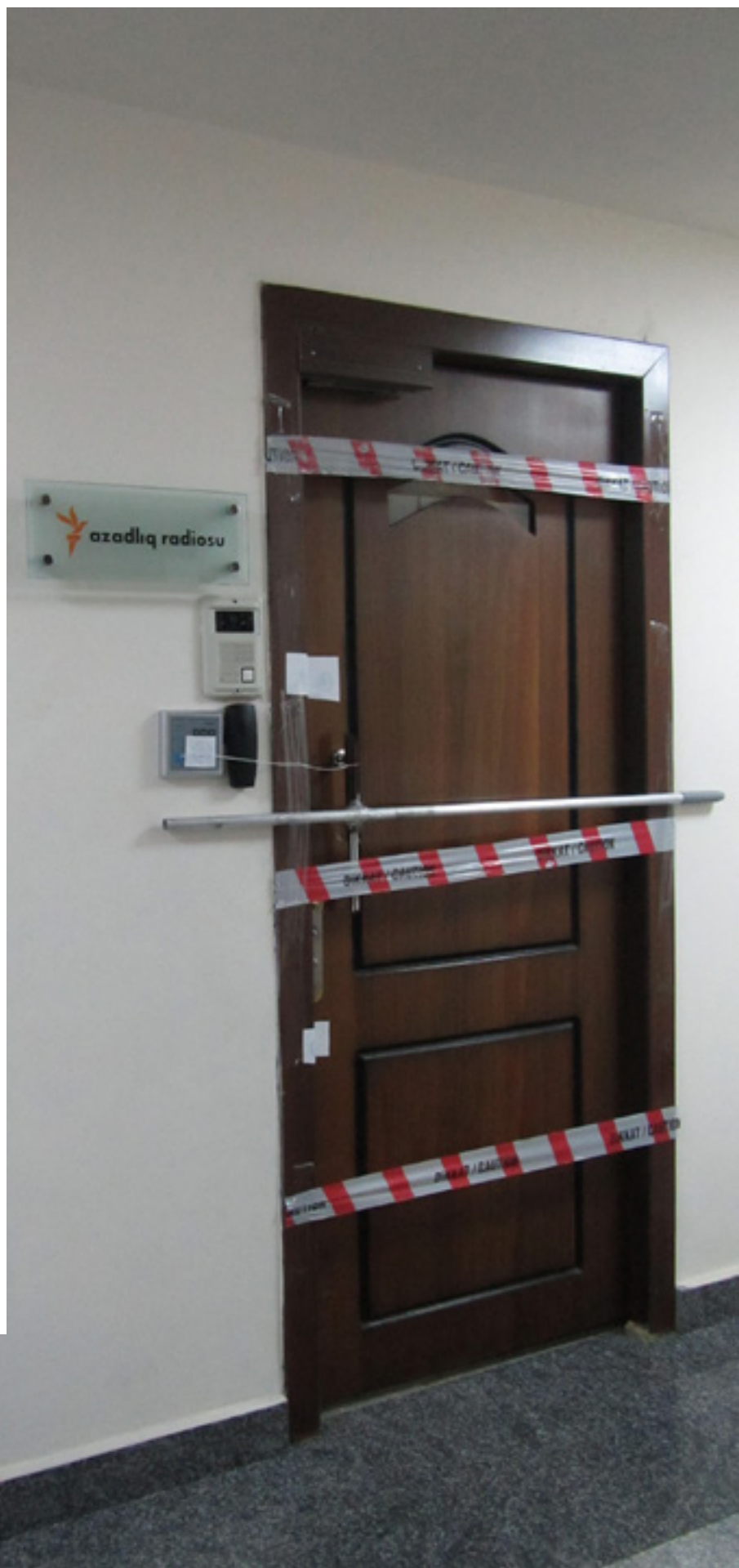
(Above) Radio Free Europe, Radio Liberty's office door remains sealed in Baku since December 2014

The Media Rights Institute, another NGO under attack by the authorities, has provided legal aid to more than a hundred journalists targeted because of their work since 2002. In August 2014, it was forced to cease all activities following a campaign of harassment by the government. The authorities froze the assets and bank accounts of the NGO and its staff, raided its premises and fined the organization 53,000 manats (approximately US$50,000) for failing to register grants. According to the organization's lawyer, the screenshots from the Ministry of Justice website showed that the grants had in fact been duly registered. However, this information disappeared from the website during the investigation.