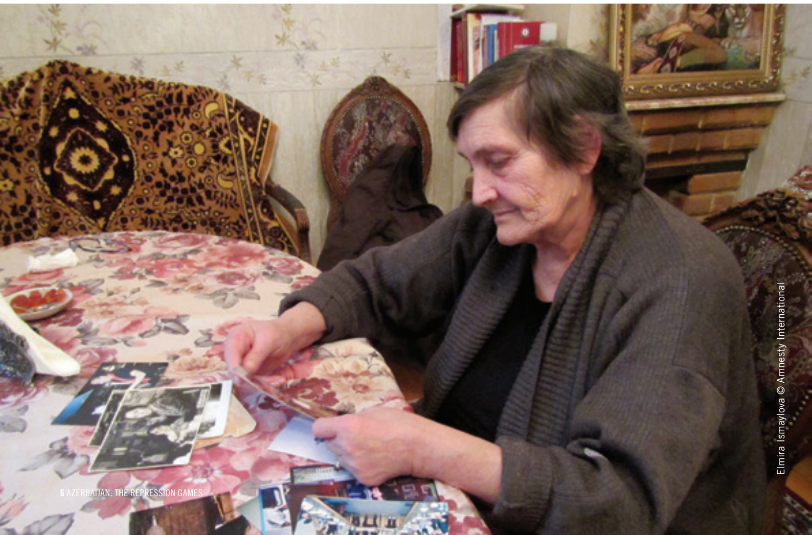
Elmira Ismayilova © Amnesty International