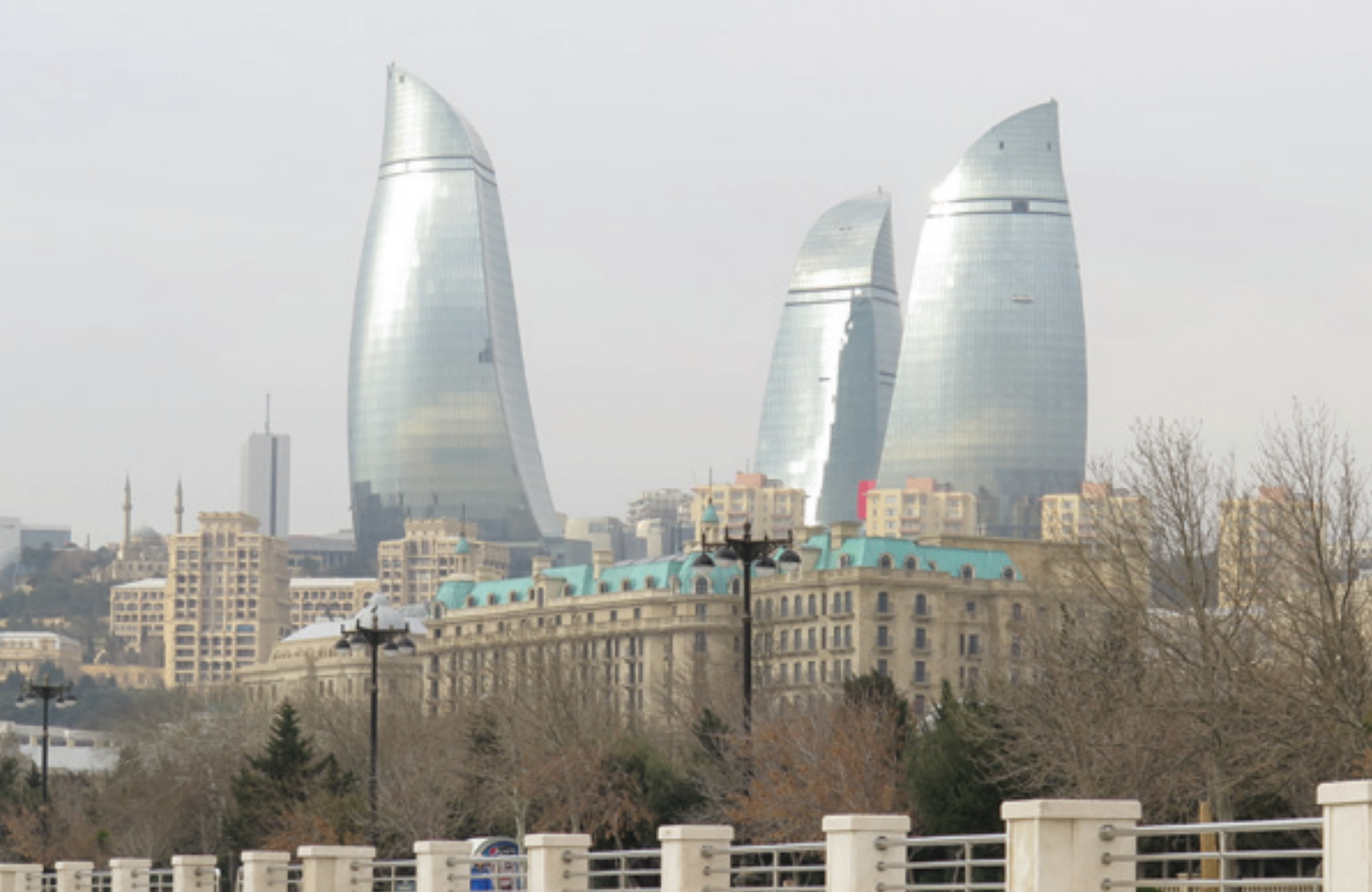
(Above) Flame Towers in downtown Baku

The first ever European Games 1 are due to take place in Baku, the capital of Azerbaijan, on 12-28 June 2015. This multi-sport event will involve around 6,000 athletes and features a new state-of-the-art stadium costing some US$640 million.