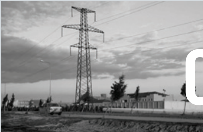
Kurdakhany detention facility