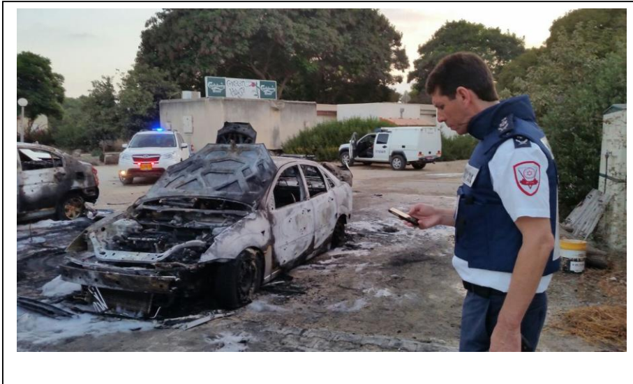
Israeli rescue workers at the scene of a rocket attack from Gaza which hit a kibbutz near the border with Gaza on 22 August 2014.