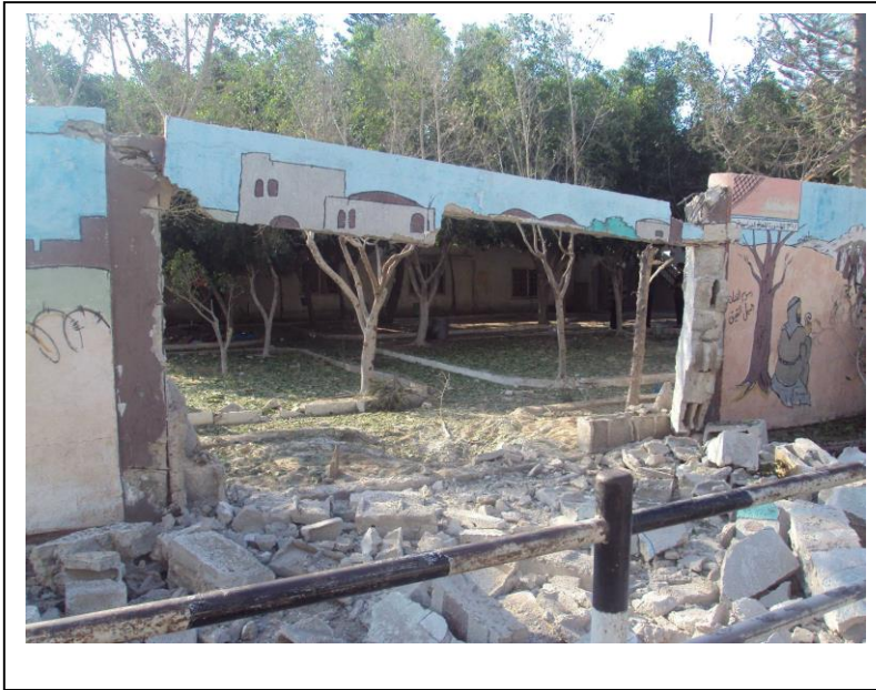
Damage to the outpatients' clinic of al-Shifa hospital in Gaza City on 28 July 2014, which evidence suggests was caused by a rocket attack by an armed Palestinian group that was aimed at Israel but fell short.

of those killed were standing in or near the doorway of the shop. Mahmoud described what happened after the explosion: