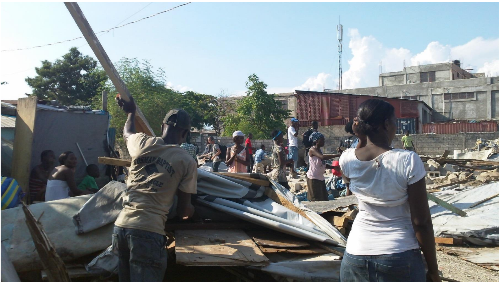
Above: Forced eviction at Camp Mozayik, Delmas municipality, Port-au-Prince, May 2012.