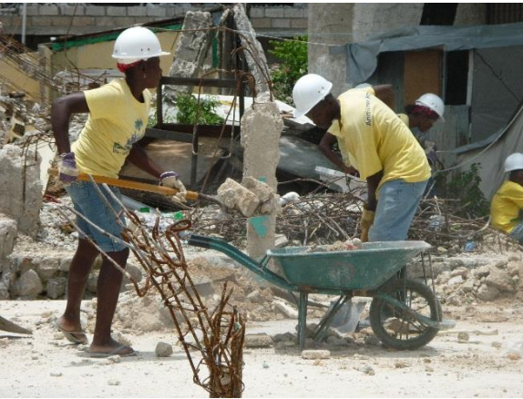
Above: Day labourers clearing away the rubble caused by the disaster, June 2010.