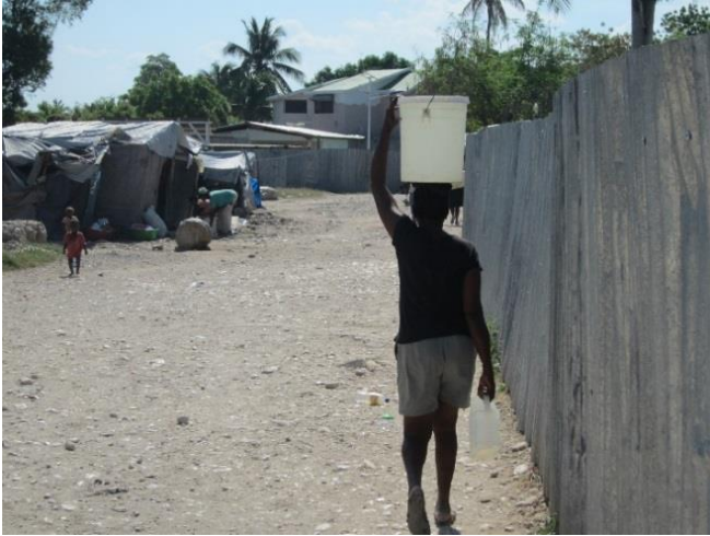
Above: Camp Grace Village, Carrefour municipality, Port-au-Prince, April 2013.