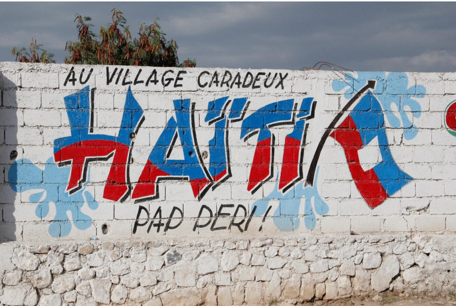
Mural reading "In Carradeux Village, Haiti lives on!", Camp Carradeux, Port-au-Prince, September 2014.