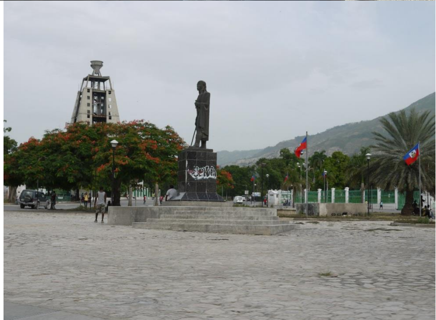
Below: Champ de Mars after the removal of the temporary shelters, July 2012.