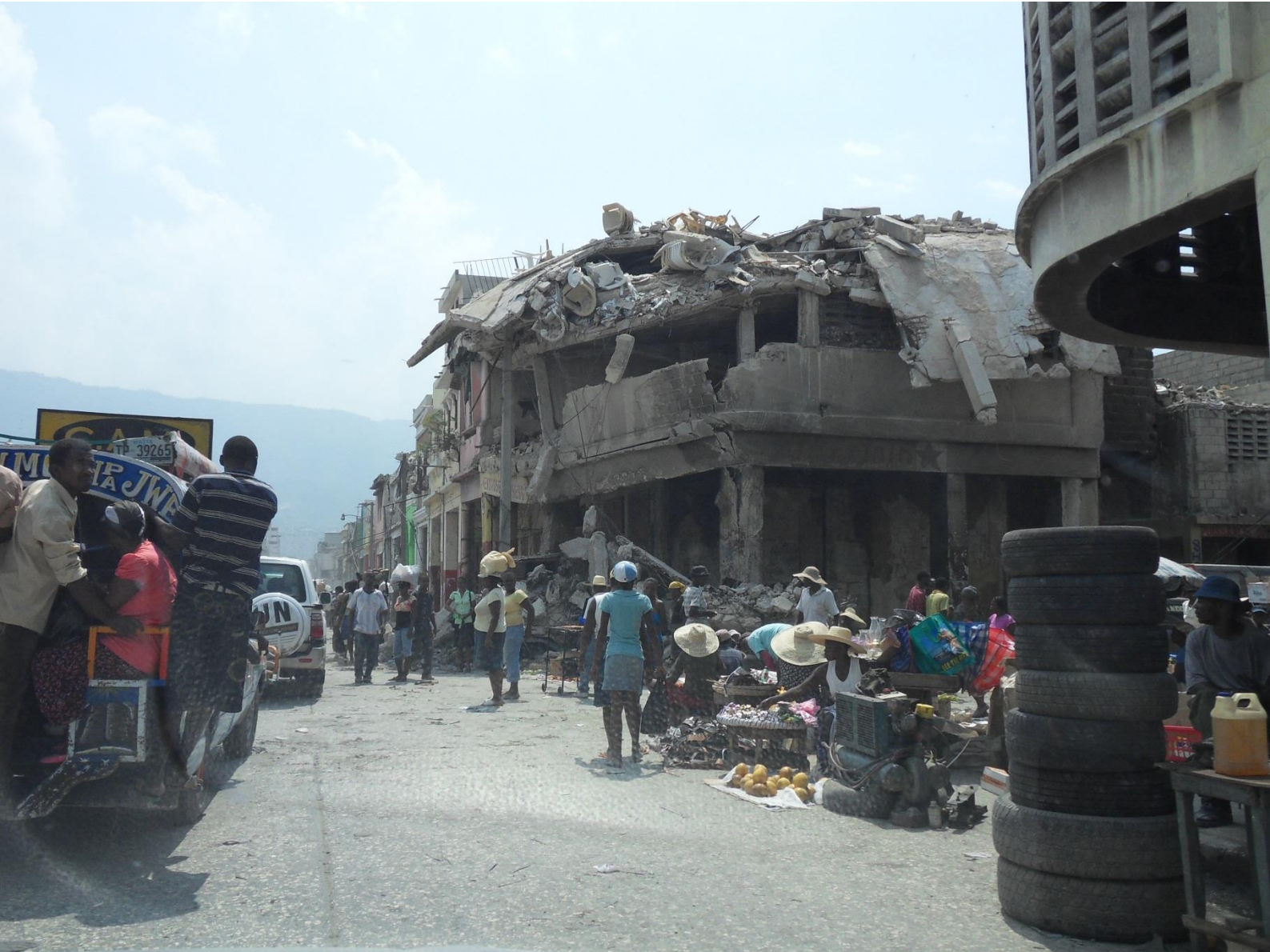
Above: Street in downtown Port-au-Prince showing the scale of the destruction, March 2010.