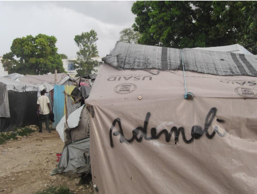
Above: Temporary shelter marked “Ademoli” (“to be demolished”), camp Grace Village, Carrefour municipality, Port-au-Prince, May 2012. Such markings are often the only warning given to families before eviction.