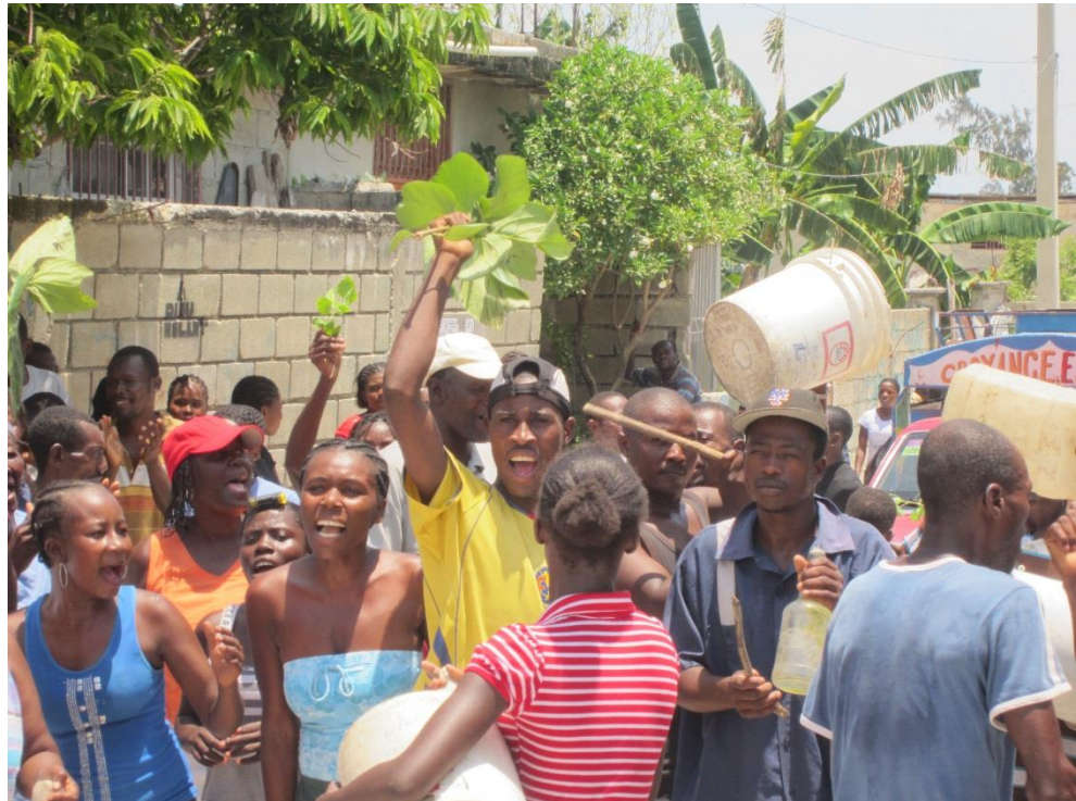
Below: Demonstration by camp residents threatened with forced evictions. Camp Grace Village, Carrefour municipality, Port-au-Prince, May 2012.