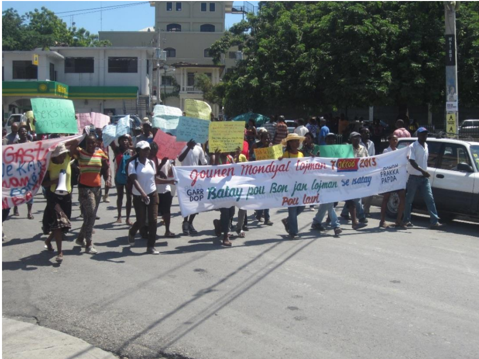
Below: Demonstration to mark World Habitat Day, Port-au-Prince, October 2013.