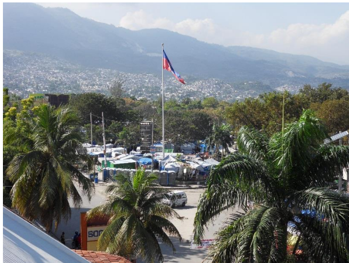
Below: Makeshift shelters in Camp Palais de l’Art, Delmas municipality, Port-au-Prince, September 2011.